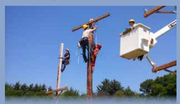
Linemen are required to practice their safety skills annually, including pole top rescues.