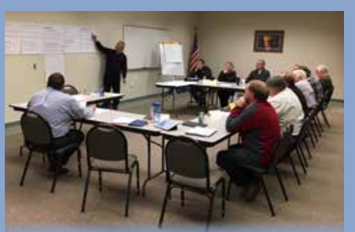
The management team and board of directors hard at work during their strategic planning session.