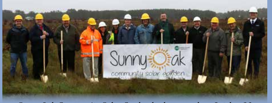
SunnyOak Community Solar Garden broke ground on October 26. Cooperative employees and directors, along with representatives from SoCore Energy were present for the event.