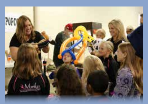
Kids and adults enjoyed the creative balloon art provided by Funny Faces Family Entertainment at Member Appreciation Day in October.