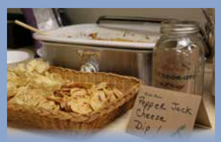
Employees raised $250 in their first Holiday Co-op Cook-off to benefit the Blue Jean Fund.