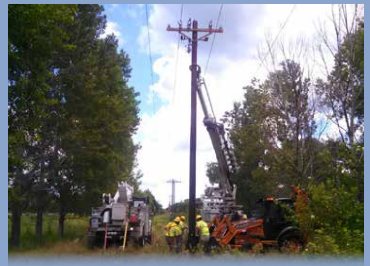
A mile of overhead three-phase was rebuilt in Oakdale, along Highway 12 & 16.