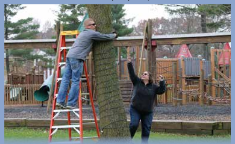
Employees volunteered their time to string holiday lights in Winnebago Park, Tomah.