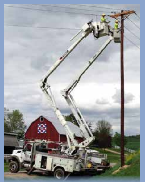
Line crews constructed new lines on county Hwy WD near Reedsburg.