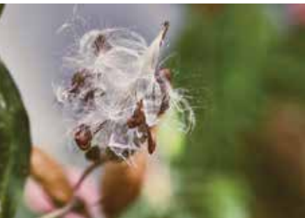
Runner-up Sisomphou Campbell, Camp Douglas Tropical milkweed seed pods

Get your cameras ready to start snapping! The 2018 Member Photo Contest runs February 1 through August 25, 2018. For more information contact dprotz@oakdalerec.com .