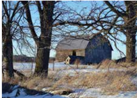
November John Froelich, Tomah Old country barn on a clear winter day