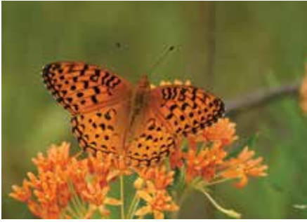
July Beth Wroblewski Fritillary butterfly