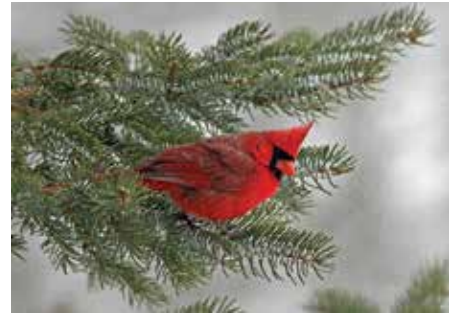
December Debra Schotten, Mauston Cardinal in a pine tree during a snowfall