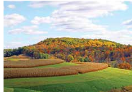
September Debra Schotten, Mauston Rolling hills in the fall